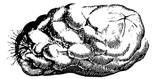
Figure 1.—Original illustration of Holothuria cuvieria . From Cuvier (1830); pl. XV fig. 9.

In the terms of the International Code of Zoological Nomenclature the species Holothuria cuvieria Cuvier is valid, but as Bell (1882) has pointed out, Blainville (1821) and Brandt (1835) were incorrect in citing Cuvier (or Peron in Cuvier) as the author of the genus-name Cuvieria , using Cuvier's footnote as a basis for their decision.